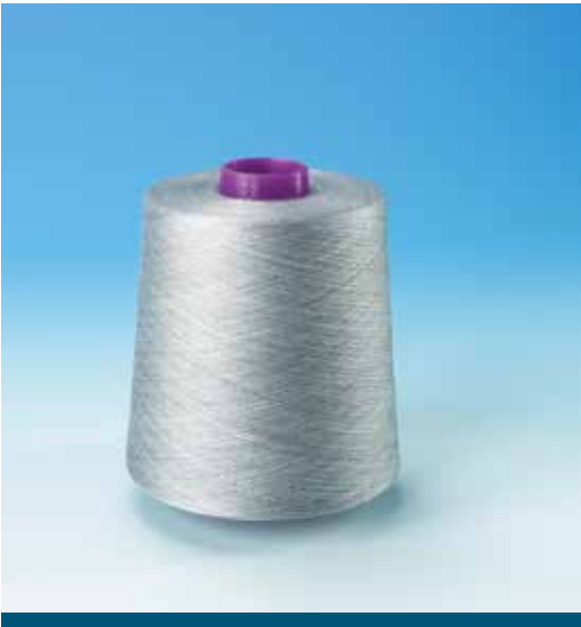
Bekaert Bekinox® BK highly electrically conductive spun yarn