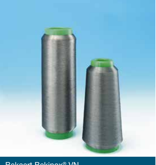
Bekaert Bekinox® VN continuous stainless steel filament yarn