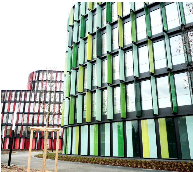
office area in Köln/Germany with 6 floors

All ceilings were executed with heating/cooling tubes. The tubes had to be reinforced with Armanet® that plaster, tubes and subground ceiling could get a strong connection to avoid cracks coming from temperature differences.