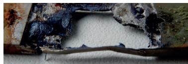
Non-coated 316L stainless steel flat wire, 6 months submerged in daily refreshed seawater at ambient temperature with CrevCorr crevice former.

A heavy zinc layer on austenitic steel offers excellent resistance to pitting and crevice corrosion, making it perfect for marine applications. That is why Bezinor ® armoring wire provides a much more predictable and reliable coating lifetime and performance against uncoated austenitic stainless steel solutions. Even when the zinc layer gets damaged, the surrounding zinc will sacrifice itself, protecting the underlying stainless steel.